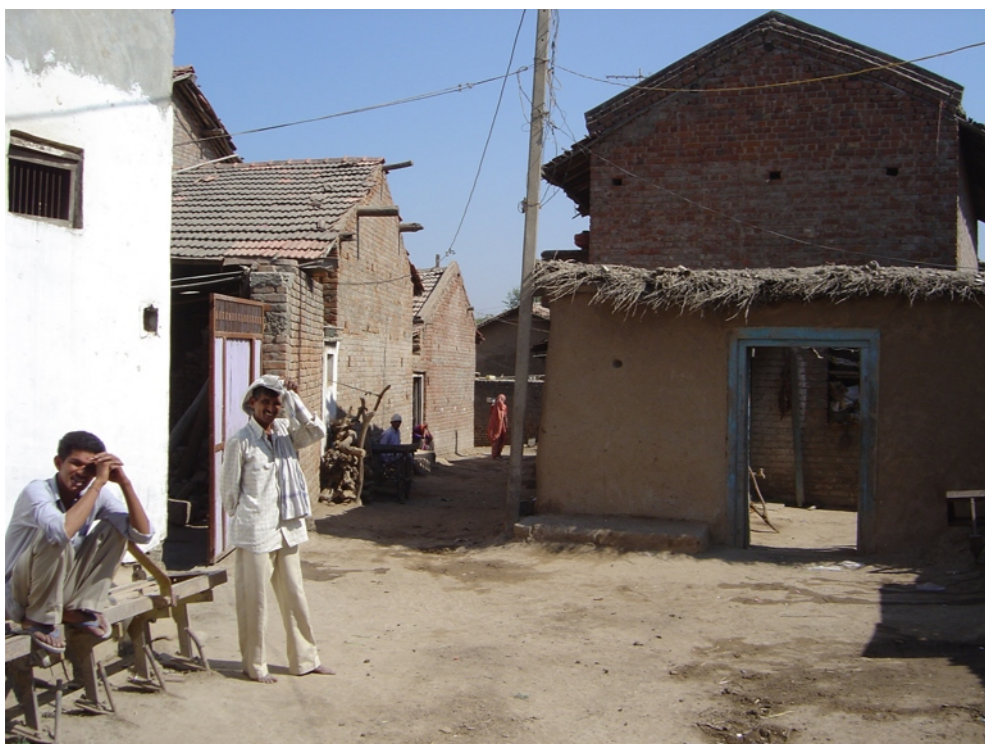
typical semi-public neighbourhood