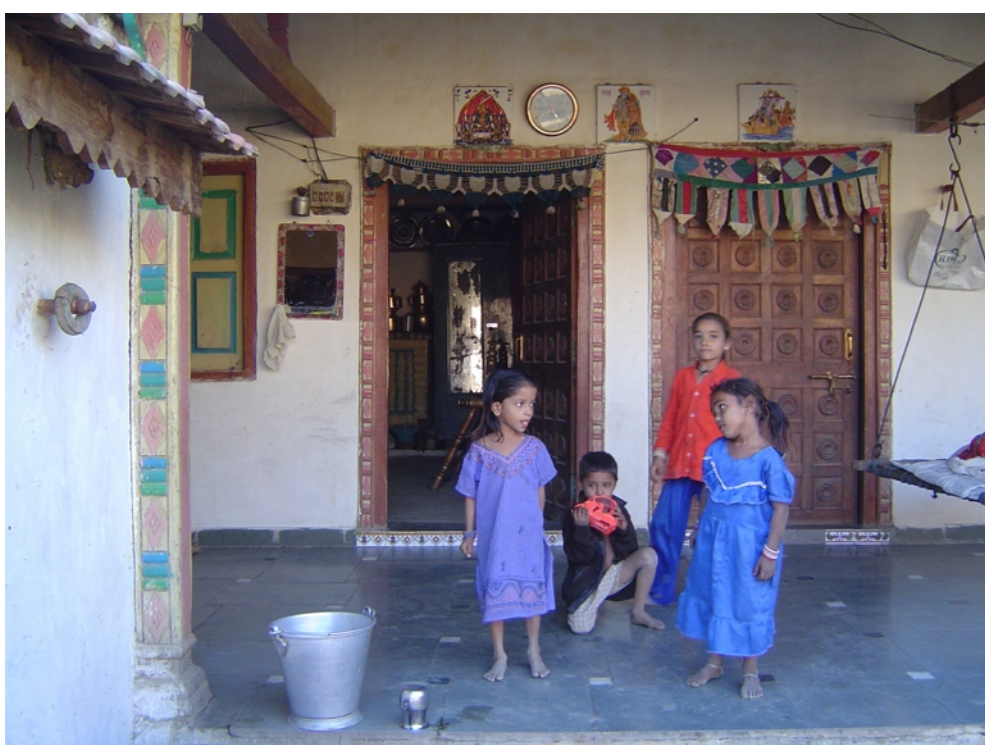
in a house