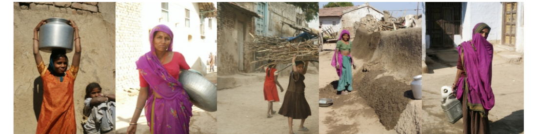
women at work