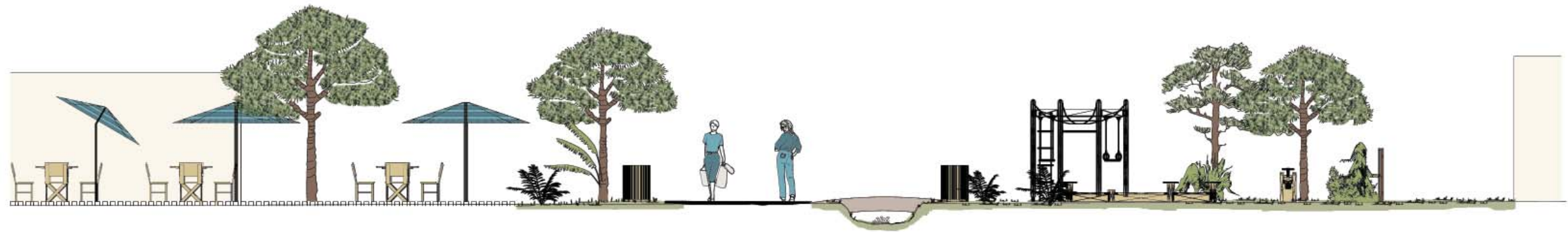
section-pedestrian zone scale 1:100