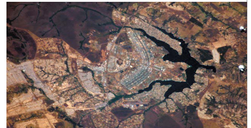
WATER CATCHMENT AREA FOR THE PARANO LAKE

The second kind of reservation also contributes to the existence of watercourses. These reservations are supplied with water from the other reservation and sometimes have a depth of 150 metres. The pollution is not so high as the first one.